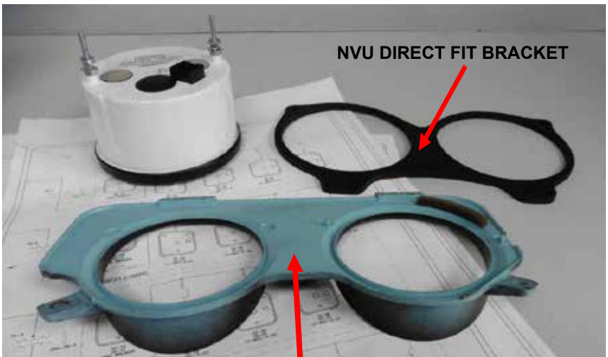
Original Spacer removed from Cluster