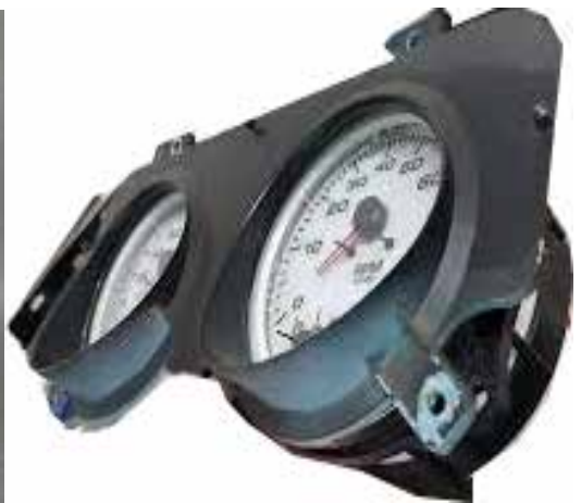
Factory Spacer should look like the above image